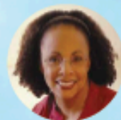
Jewell Parker Rhodes