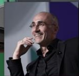
KEYNOTE SPEAKER ARTHUR C. BROOKS | 6 PM

OCTOBER 27, 2022 10 AM | REGISTRATION UVU CLARKE BUILDING (CB) 101